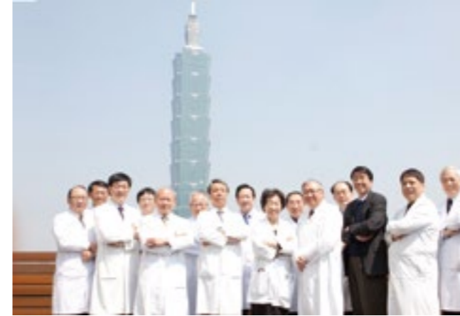
March 21, 2014 Translational Cancer Research Center's Academic Research Team