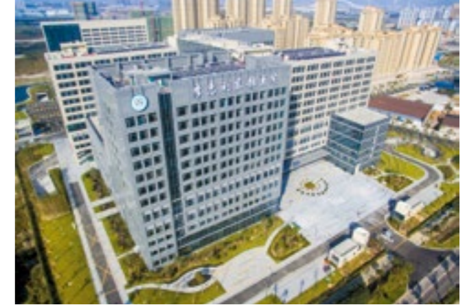
March 2015 Ningbo Medical Center LiHuiLi Eastern Hospital TMU Ningbo Medical Center