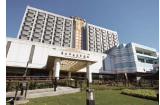
July 17, 1996 Wan Fang Medical Center