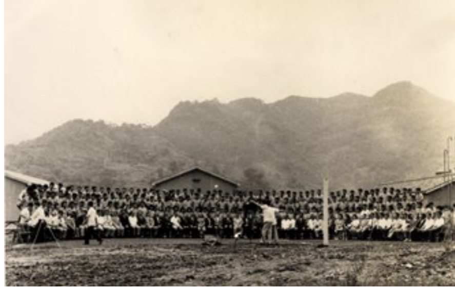
June 11, 1960 Group Photo of the Inaugural Class