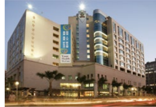
August 1, 1976 Taipei Medical University Hospital