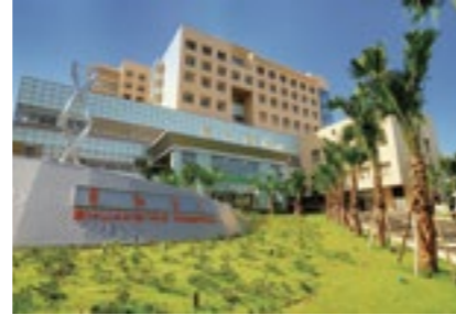
July 1, 2008 Shuang Ho Hospital