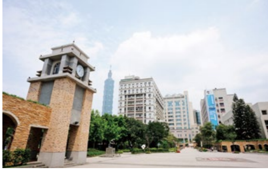
March 8, 2004 TMU Campus