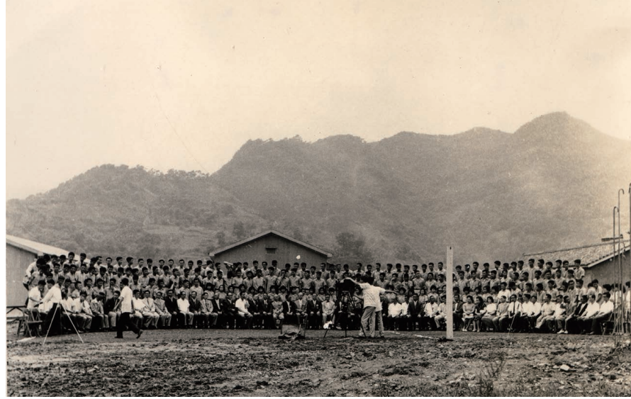
June 11, 1960 Group photo of the Inaugural Class