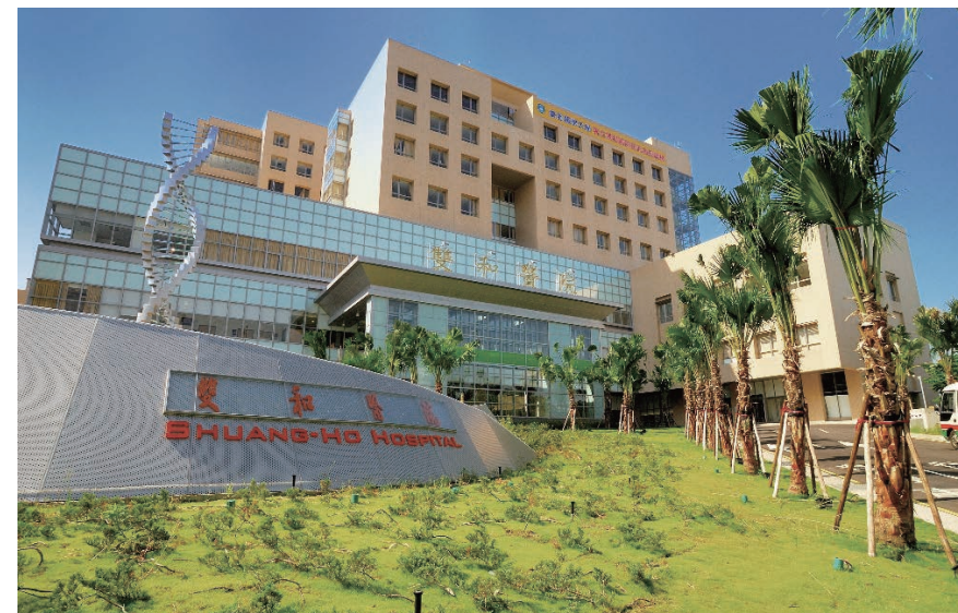
July 1, 2008 Shuang Ho Hospital