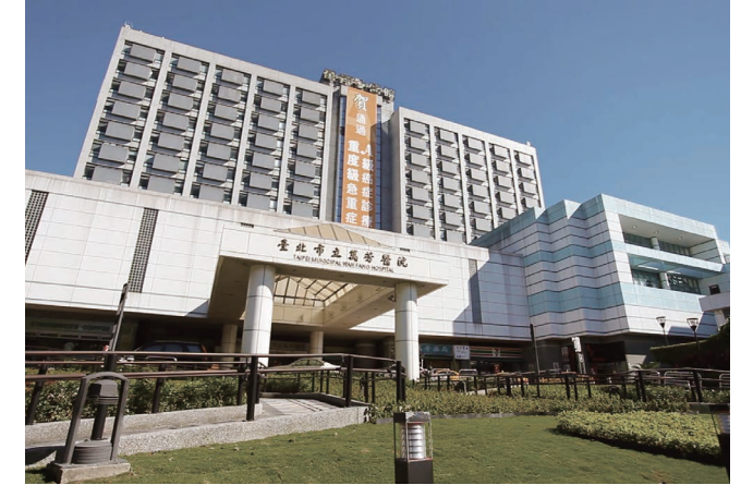
July 17, 1996 Taipei Municipal Wanfang Hospital