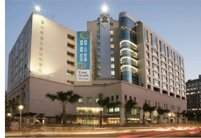
August 1, 1976 Taipei Medical University Hospital