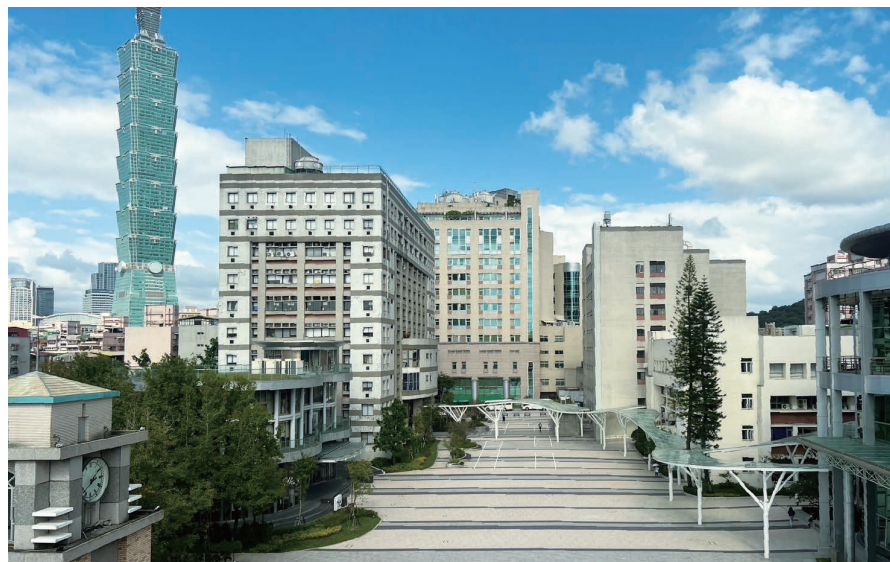
Taipei Medical University