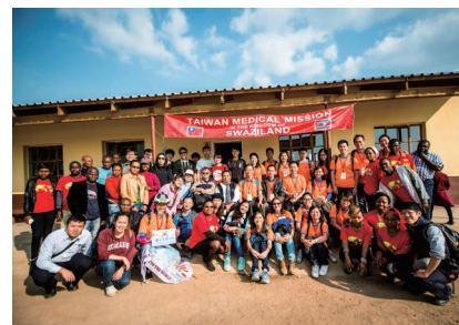
2008 Medical Mission in Kingdom of Eswatini